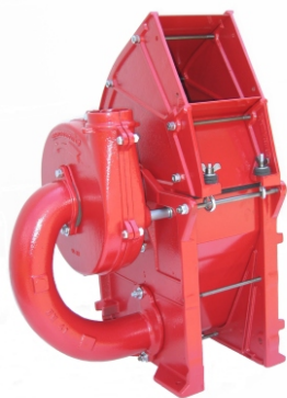
No. 10 BLOWER