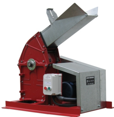
BOTTOM DISCHARGE STANDARD PACKAGE